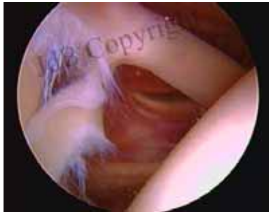
Frayed/torn biceps tendon.