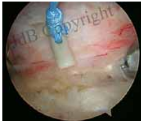
Transfer of the tendon to the groove using metal/biological screws and devices.

Another method that can be used in elderly individuals is simply detaching the tendon from the socket and allowing it to slip down the groove ( Biceps tenotomy ). Although similar to a rupture, this method has been shown to provide excellent relief of pain and is ideal in patients for whom a cosmetic deformity is not an issue.