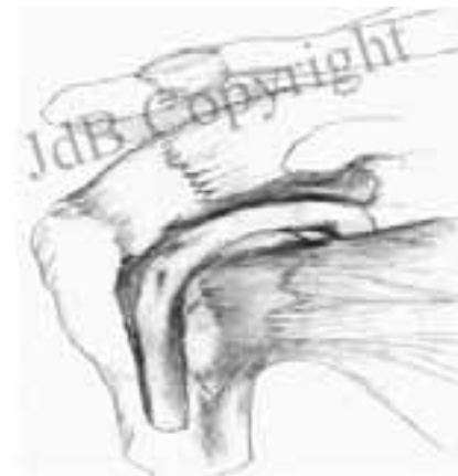
Arthroscopic view (left) and diagrammatic representation (right) of the Biceps tendon passing through the groove.