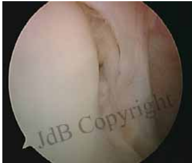
SLAP tear: separation of biceps tendon attachment from the upper end of the shoulder socket.