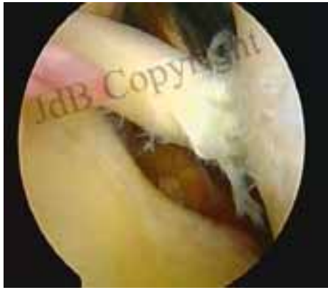
Torn biceps tendon.